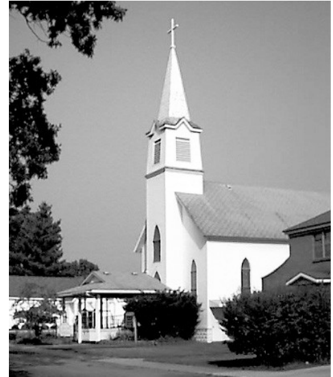
St. Joseph Catholic Church 965 Newell St., White Cloud, MI 49349