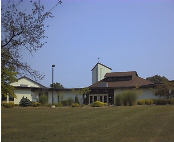
All Saints Catholic Church 500 Iroquois, Fremont, MI 49412

Twenty-Fifth Sunday in Ordinary Time – September 20, 2009