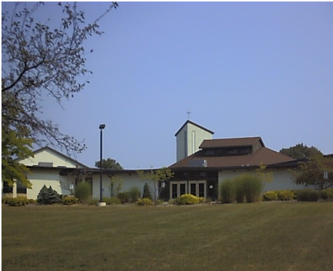
All Saints Catholic Church 500 Iroquois, Fremont, MI 49412