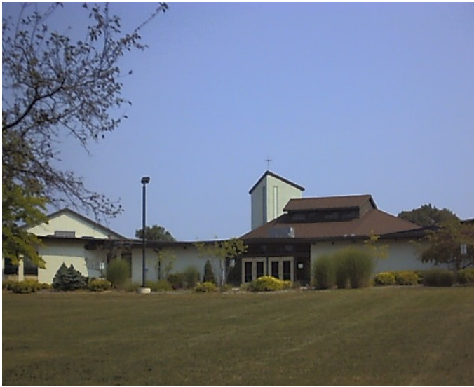
All Saints Catholic Church 500 Iroquois, Fremont, MI 49412

Twenty-First Sunday in Ordinary Time – August 23, 2009