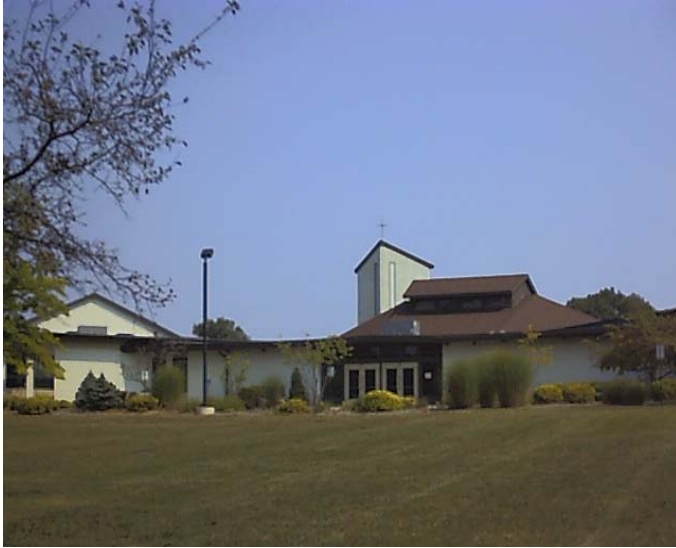
All Saints Catholic Church 500 Iroquois, Fremont, MI 49412