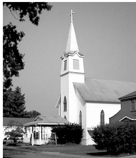
St. Joseph Catholic Church 965 Newell St., White Cloud, MI 49349