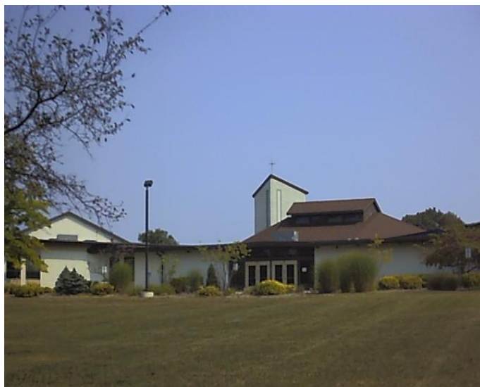
All Saints Catholic Church 500 Iroquois, Fremont, MI 49412