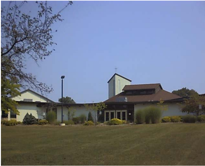
All Saints Catholic Church 500 Iroquois, Fremont, MI 49412

Second Sunday of Lent - February 28, 2010