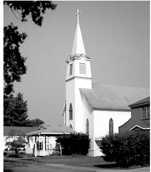
St. Joseph Catholic Church 965 Newell St., White Cloud, MI 49349