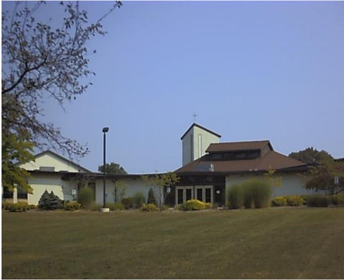
All Saints Catholic Church 500 Iroquois, Fremont, MI 49412

Solemnity of Mary, The Holy Mother of God— January 1, 2012